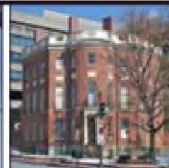
American Institute of Architects in Washington and Hearst Corp Headquarters (L) in New York where new structures are either in contrast to original buildings or act as muted backdrops